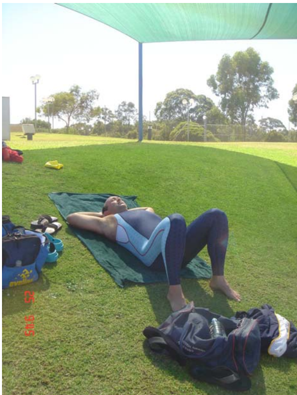
The phantom rests...