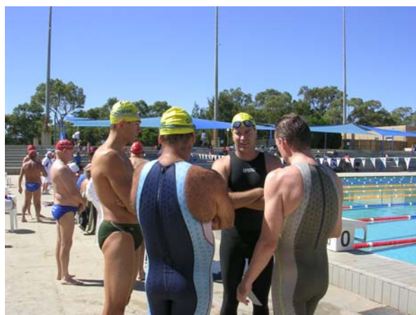
The boys discuss tactics...