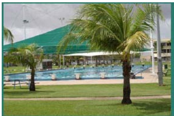
The Casuarina Pool in Darwin